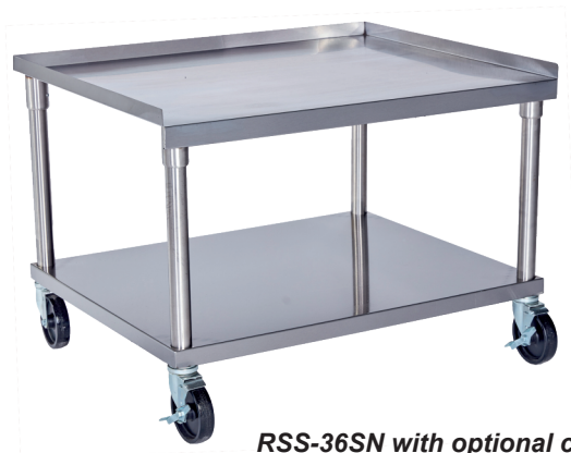
RSS-36SN with optional casters

Models: RSS-12SN RSS-18SN RSS-24SN RSS-30SN RSS-36SN RSS-48SN RSS-60SN