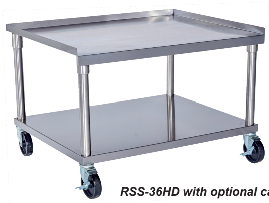
RSS-36HD with optional casters

Models: RSS-12HD RSS-18HD RSS-24HD RSS-30HD RSS-36HD RSS-48HD RSS-60HD RSS-72HD