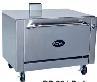
RR-36-LB shown with optional casters