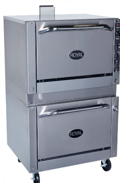
RR-36-DS-C shown with optional casters

Models: RR-36-LB RR-36-LB-C RR-36-DS RR-36-DS-C* RR-36-DS-CC