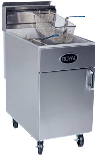
REEF-65 with optional casters