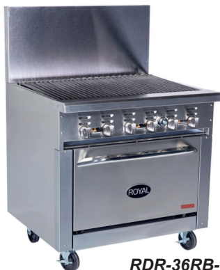
RDR-36RB-126 with optional casters

Models: RDR-24RB-120 RDR-24RB-XB RDR-36RB-126 RDR-36RB-XB RDR-48RB-126