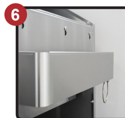
Removable Speed Rail