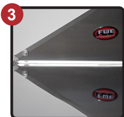
Stainless Steel Construction