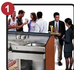
Perfect For Event Hosting