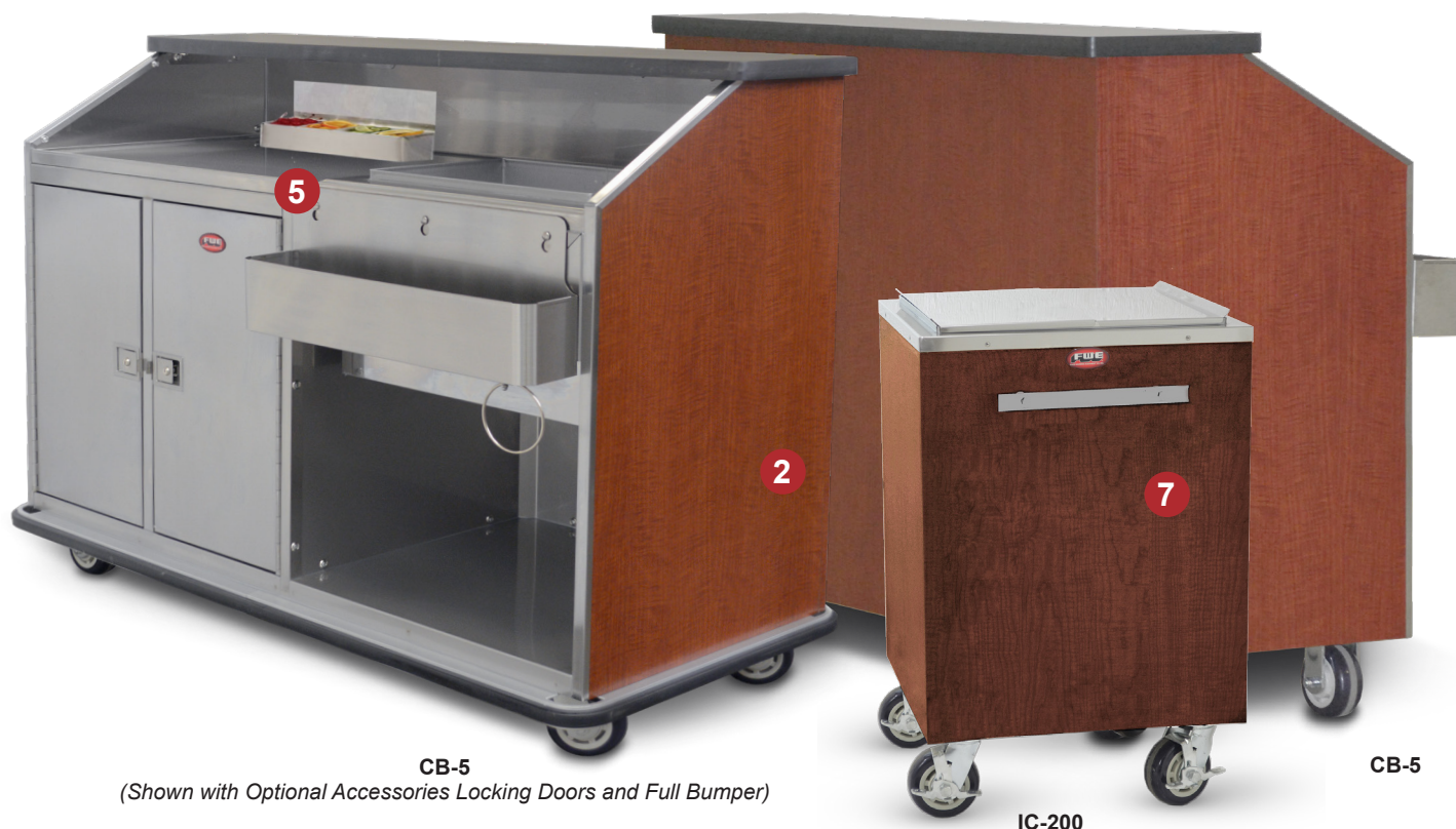
CB-5 (Shown with Optional Accessories Locking Doors and Full Bumper)