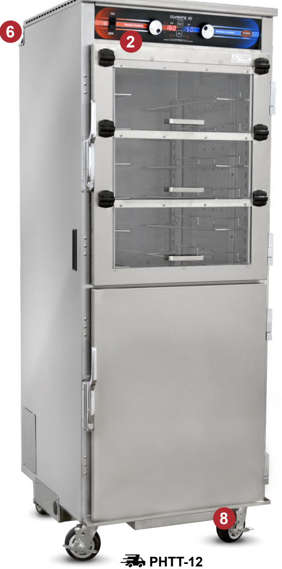
(Shown with Optional Accessories Flip-Up Doors and Handles)