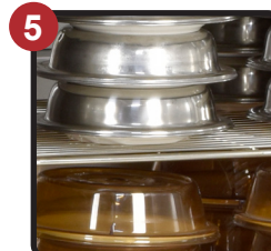
Heavy-Duty "No Sag" Shelves