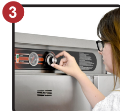
Eye-Level Control Panel