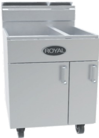
RFT-5025 with optional casters