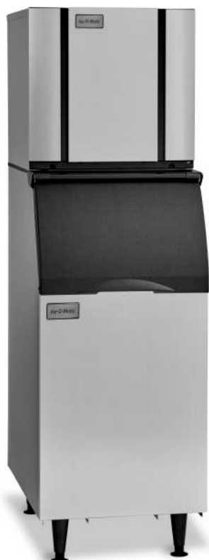
CIMO520 ON B42