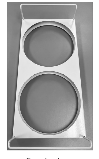
CEFTH Metal Tub Holder