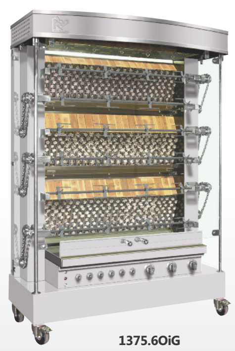
Stainless steel finish